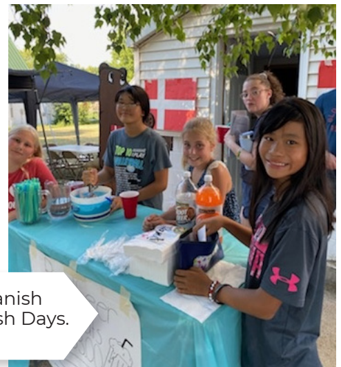
Our Youth group served the Danish meal on Friday July 15th of Danish Days. Many attended.