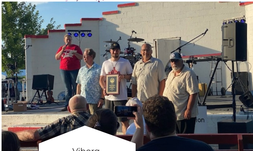
Viborg Ministerial were the Friends of Viborg at Danish Days 2022

Aug 28 - Jeremiah 2:4-13, Psalm 112, Hebrews 13:1-8, 15-16, Luke 14:1, 7-14