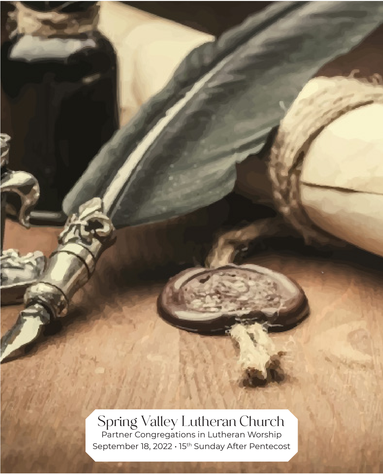
Spring Valley Lutheran Church Partner Congregations in Lutheran Worship September 18, 2022 • 15 th Sunday After Pentecost