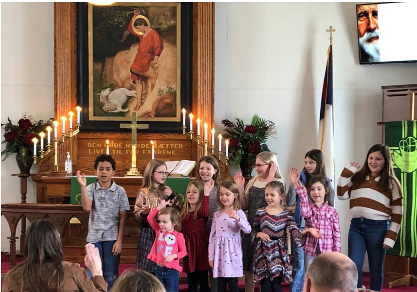
Kids sang Father Abraham in church Feb 12 th and some members joined in the fun at their pews