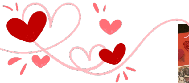
Our Saviors Sunday School made 63 Valentine's cards for the nursing home. Lots of fun and glitter!