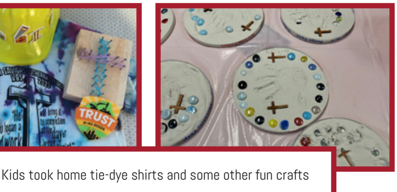
4 Age Groups