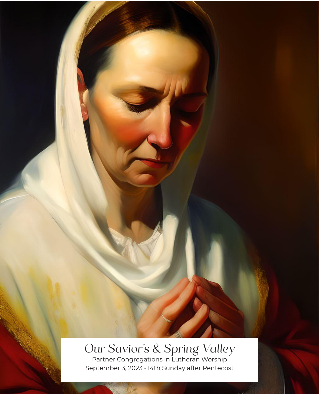
Our Savior’s & Spring Valley Partner Congregations in Lutheran Worship September 3, 2023 • 14th Sunday after Pentecost